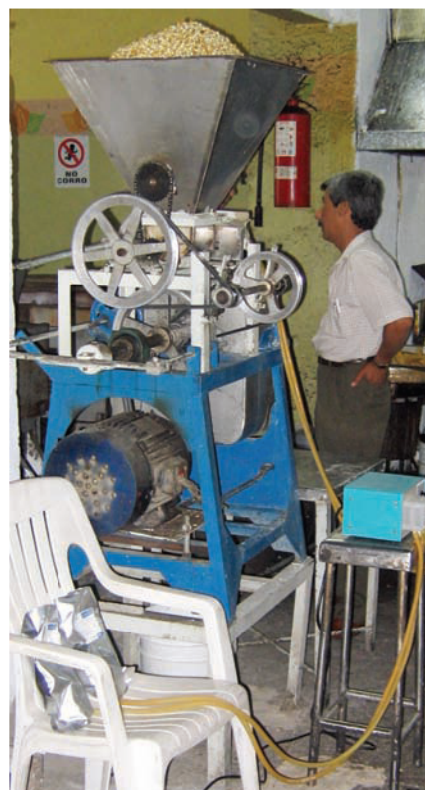
Fig. 2. Peristaltic pump used for liquid enrichment premix dosing. Tubes carrying vitamin and mineral premixes are shown.