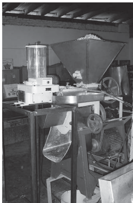
Fig. 3. Powder dosifier used for addition of dry enrichment premix to nixtamal.

Initial testing of the liquid premix yielded tortillas with significantly darker, reddish-brown color compared to the unforti-